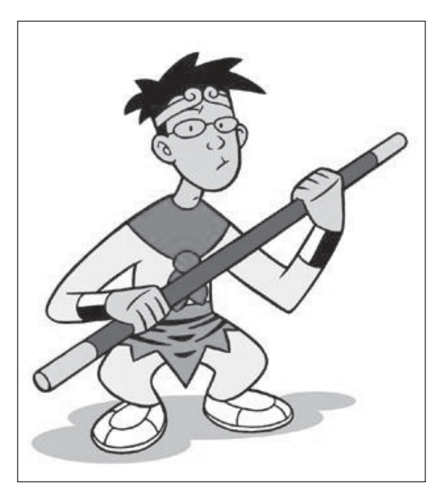
Gene Luen Yang's self-caricature as the Monkey King. ©Gene Luen Yang