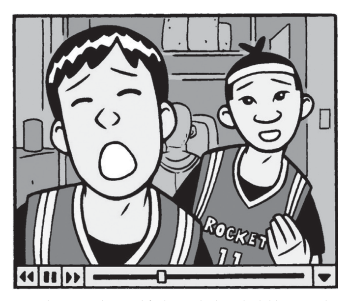
YouTube screenshot modified to make boys look like Jin and Wei-Chen